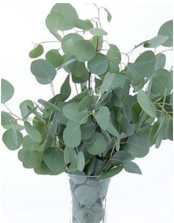
Eucalyptus Silver Dollar