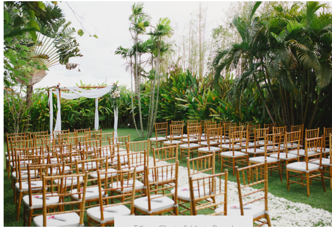
Tiffany Chairs & Virgin Road