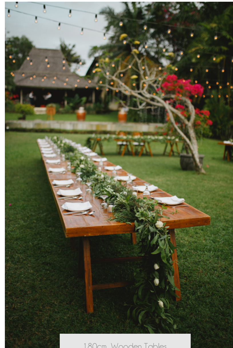
180cm Wooden Tables