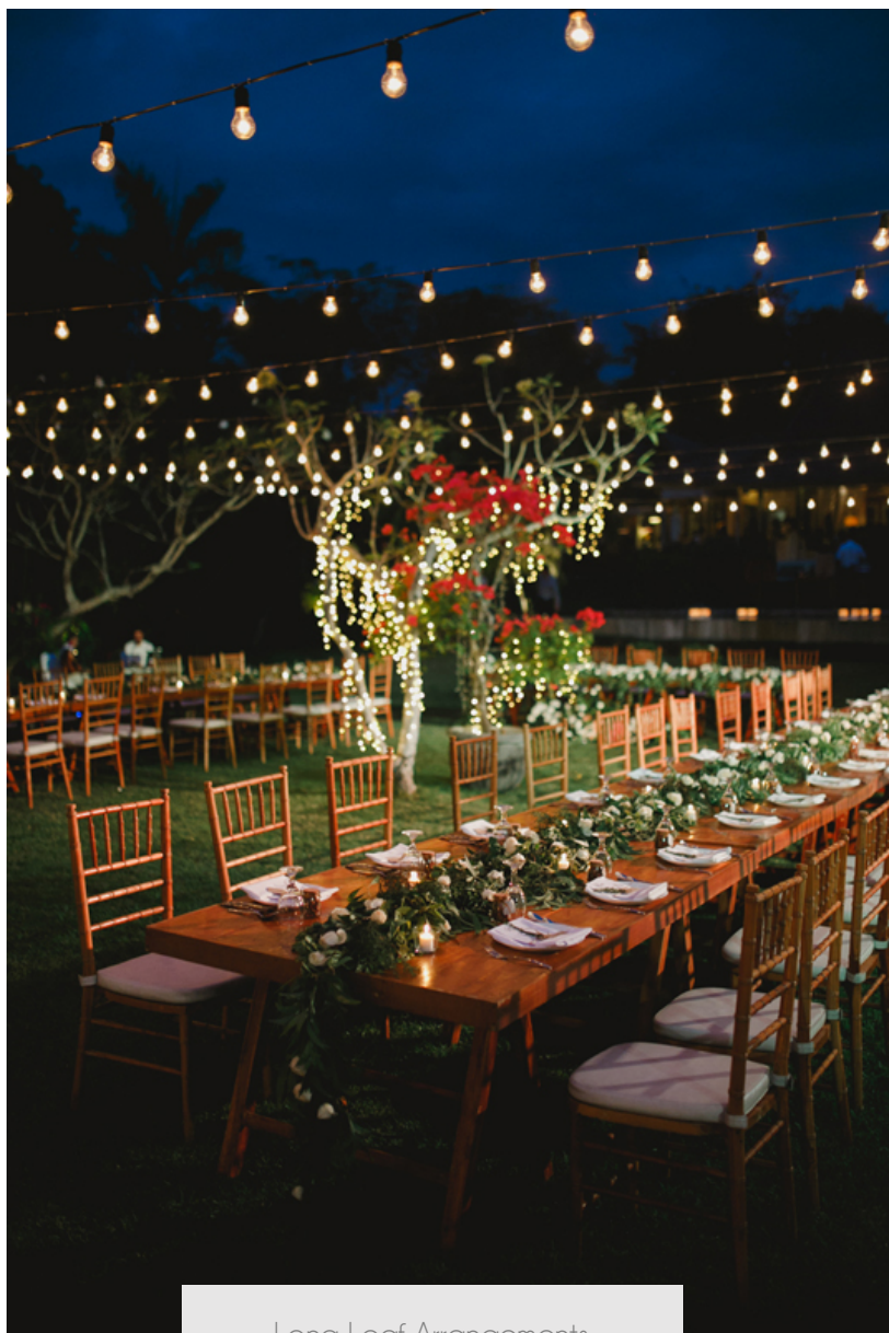
Long Leaf Arrangements