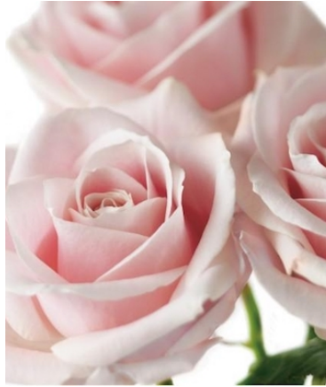
Soft Pink Rose